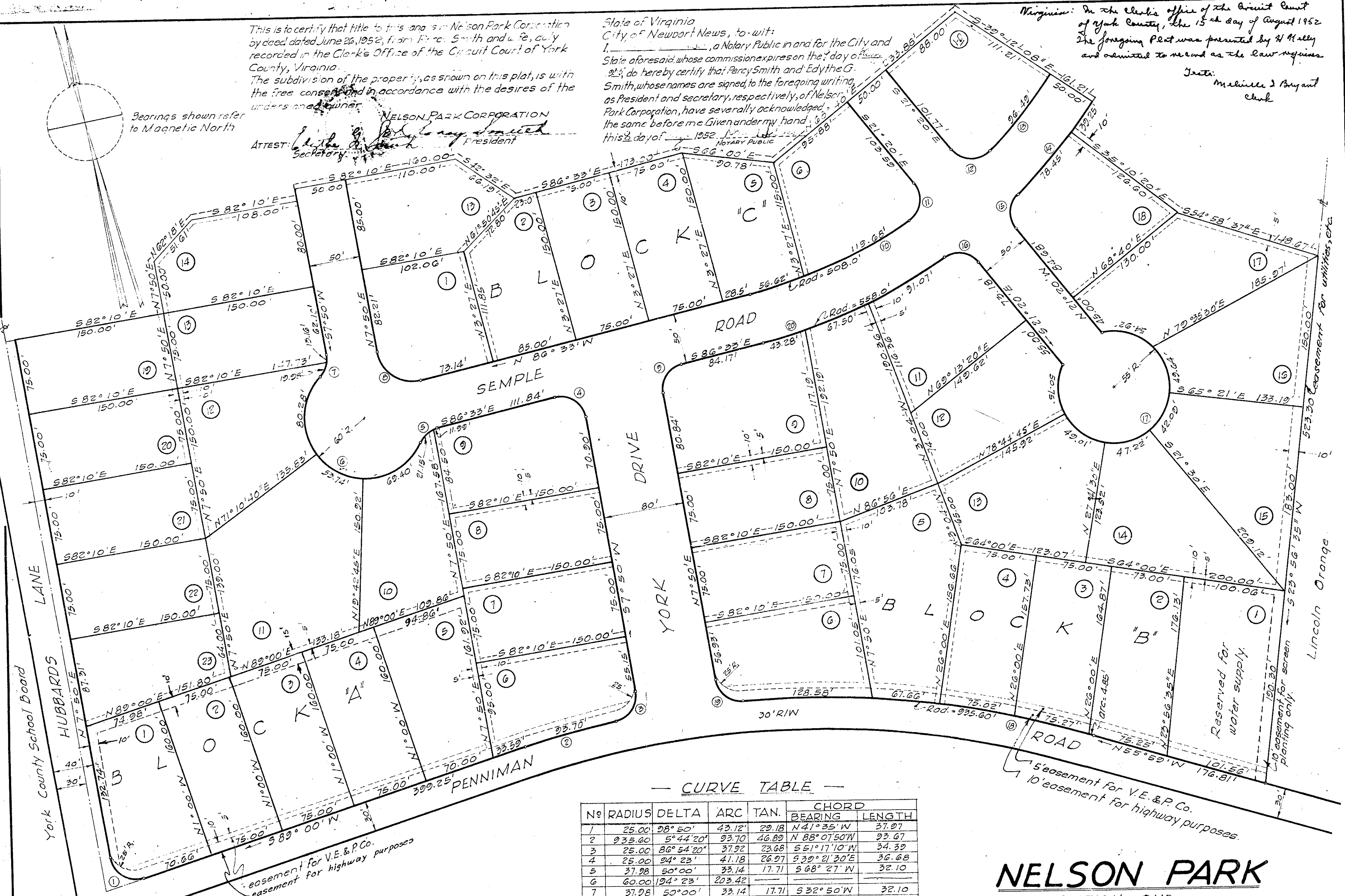
— CURVE TABLE —