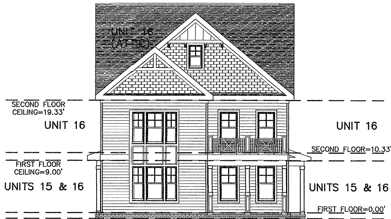
FRONT ELEVATION (PUBLIC STREET SIDE)