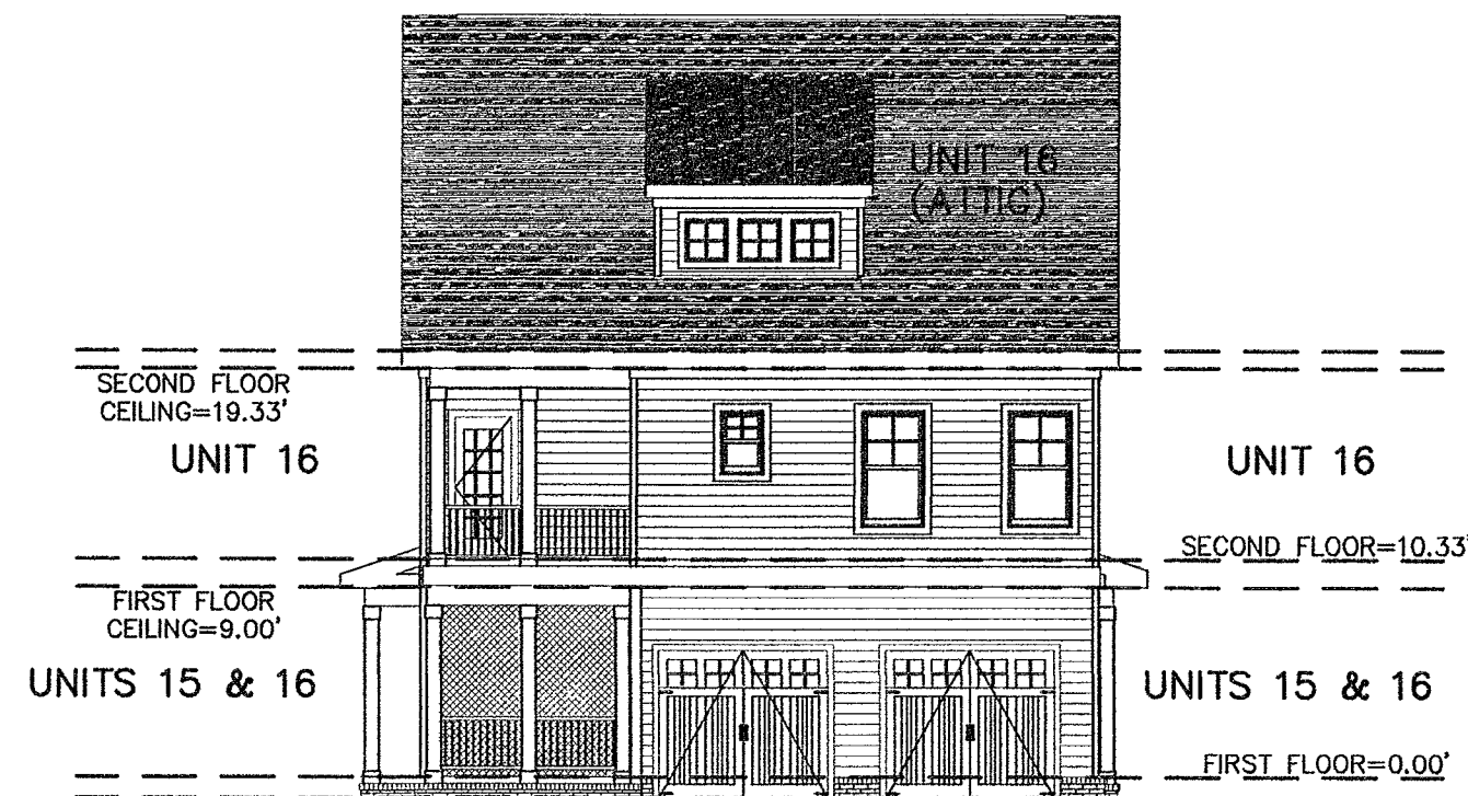
REAR ELEVATION (PRIVATE LANE SIDE)