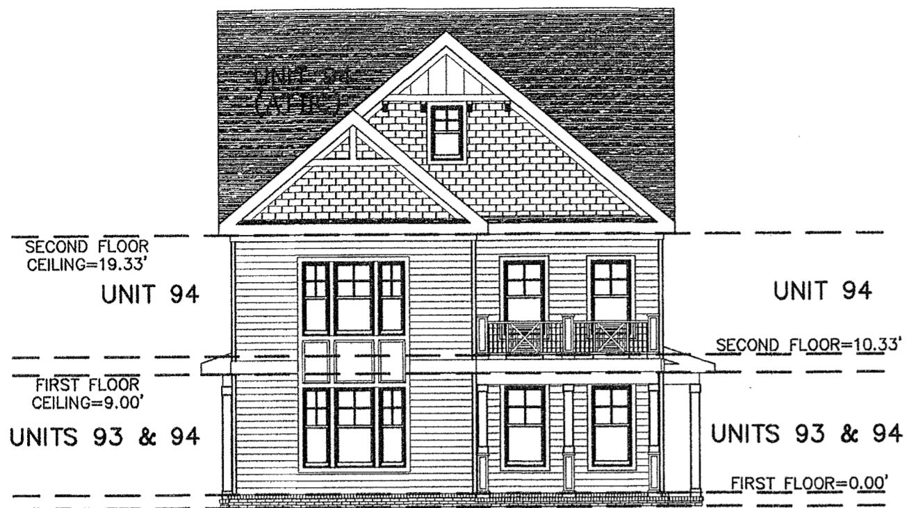
FRONT ELEVATION (PUBLIC STREET SIDE)