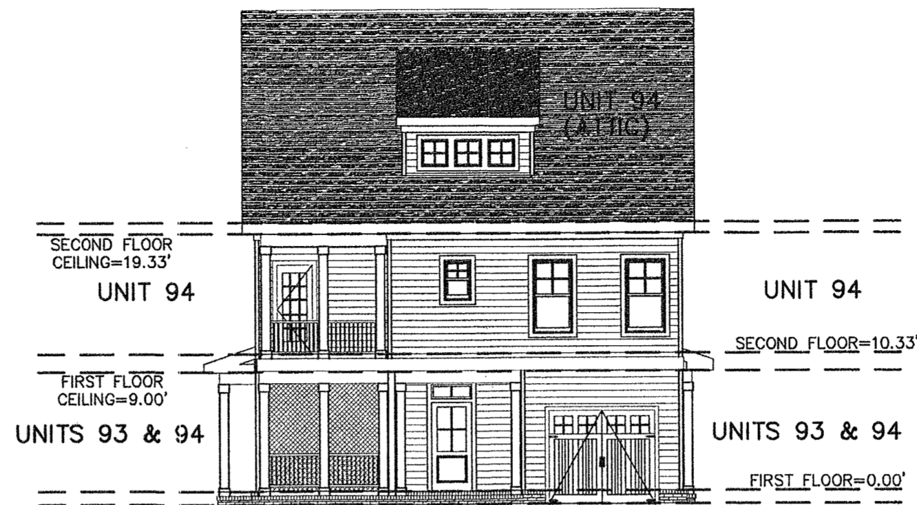
REAR ELEVATION (PRIVATE LANE SIDE)