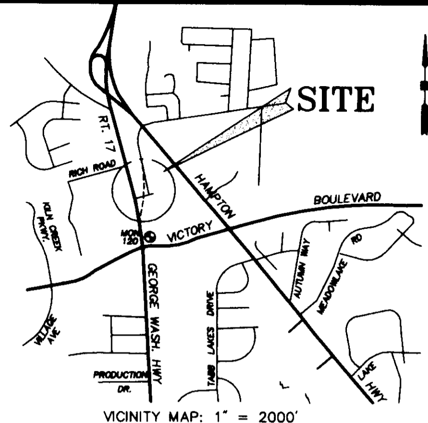
VICINITY MAP: 1" = 2000'