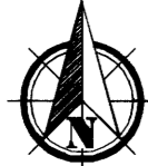
VICINITY MAP (Approximate Scale: 1" = 2000')

Map Copyright © Kappa Map Group LLC. (800) 829-6277 Used with permission-Permitted Use Number 21004223