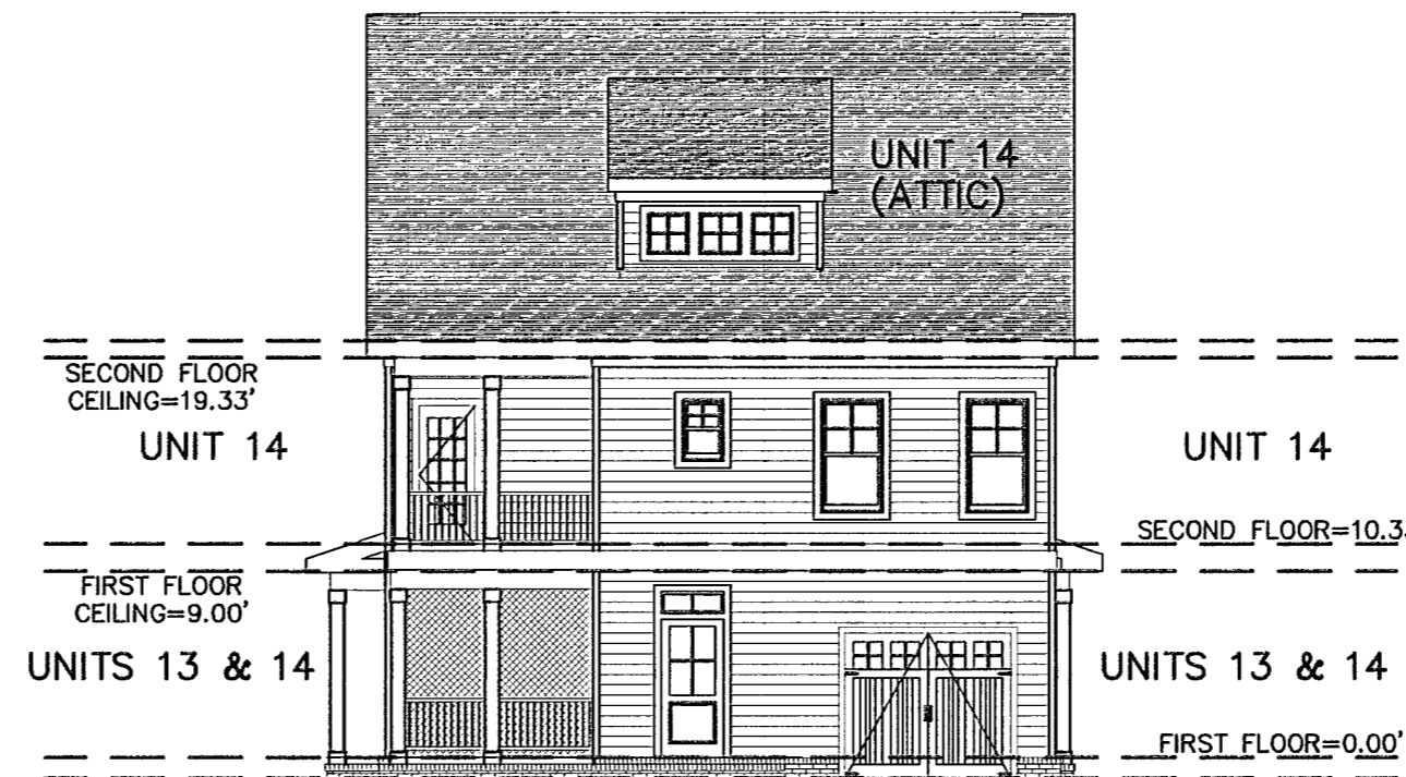
REAR ELEVATION (PRIVATE LANE SIDE)