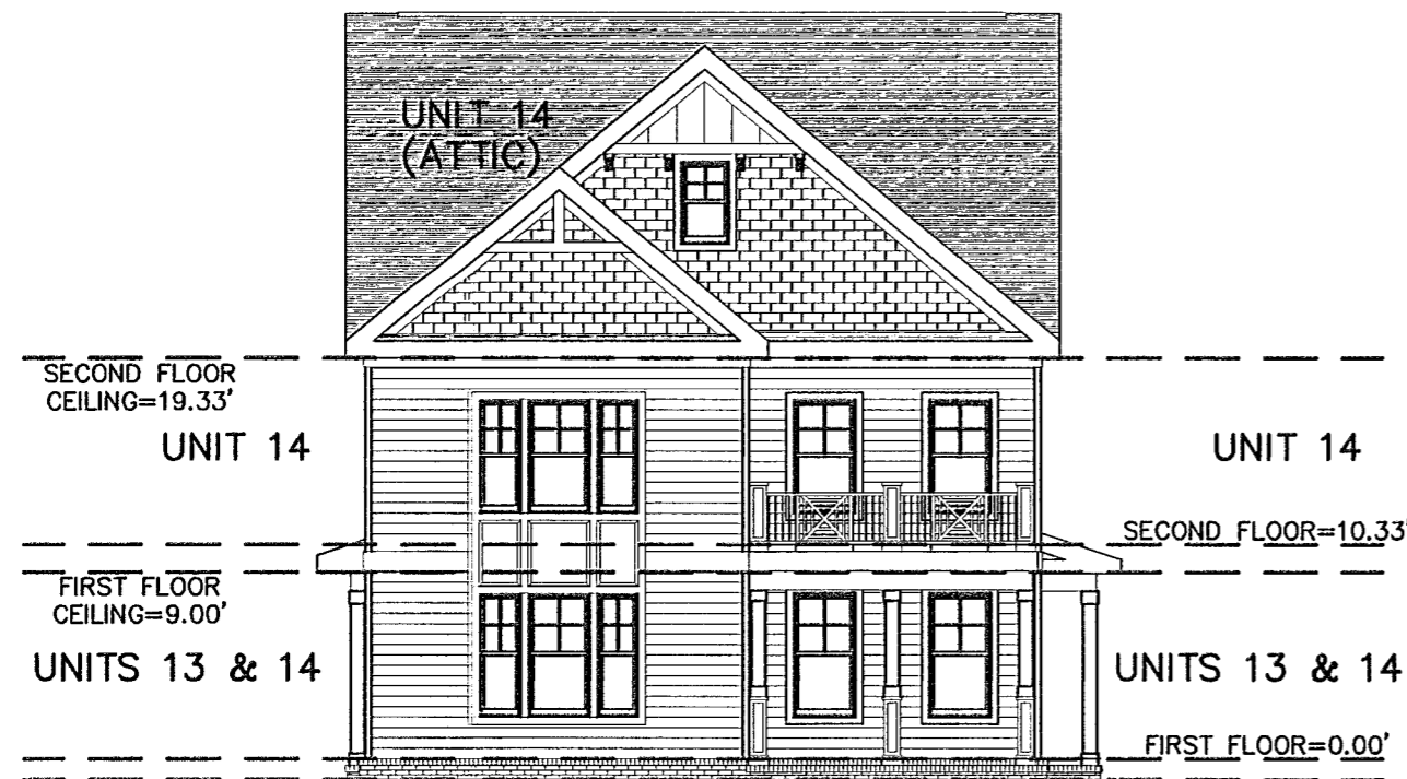
FRONT ELEVATION (PUBLIC STREET SIDE)