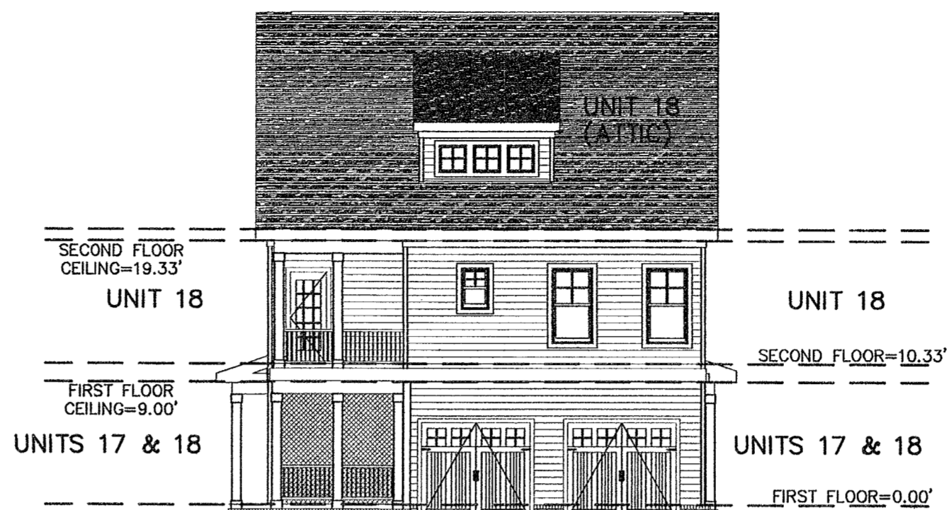
REAR ELEVATION (PRIVATE LANE SIDE)