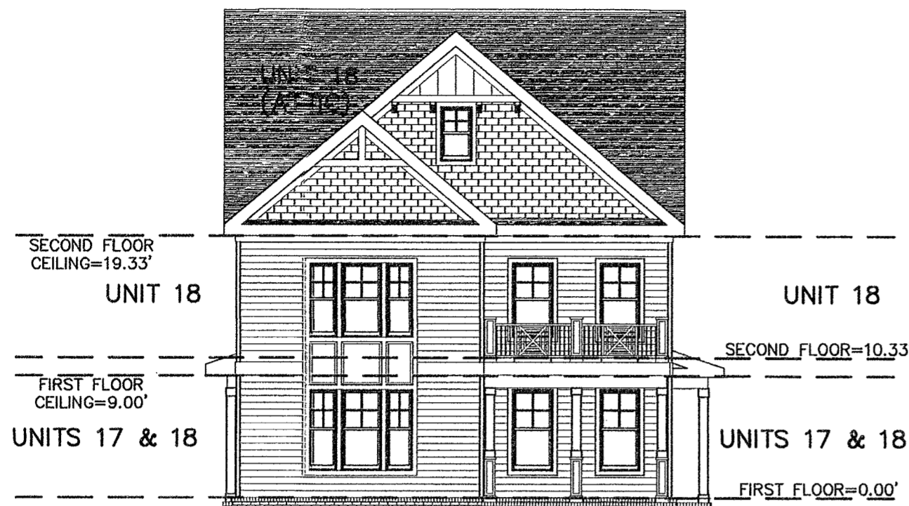
FRONT ELEVATION (PUBLIC STREET SIDE)