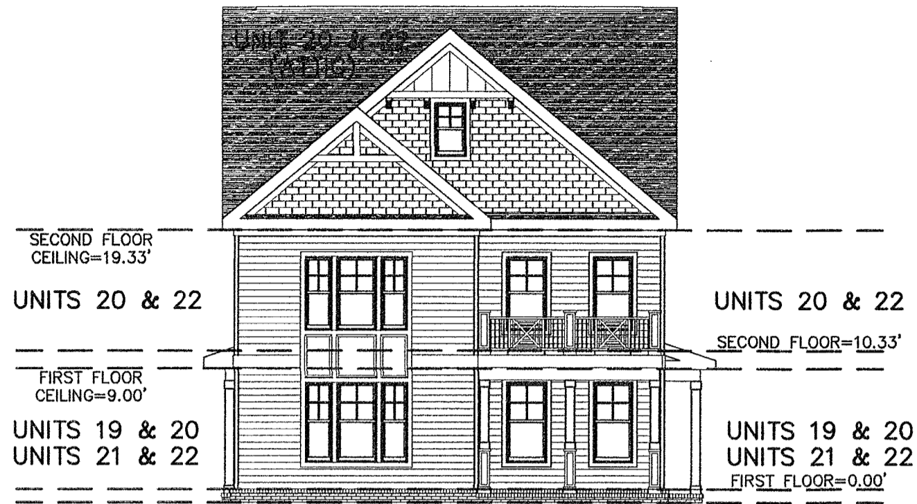
FRONT ELEVATION (PUBLIC STREET SIDE)