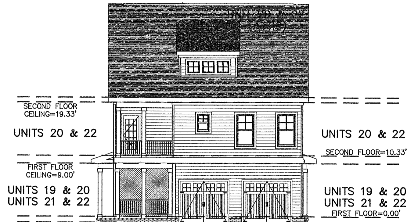
REAR ELEVATION (PRIVATE LANE SIDE)