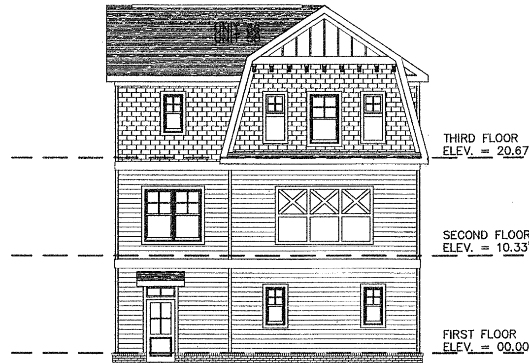
REAR ELEVATION (PUBLIC STREET SIDE)