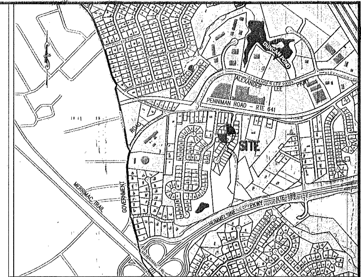
VICINITY MAP 1"=1000'