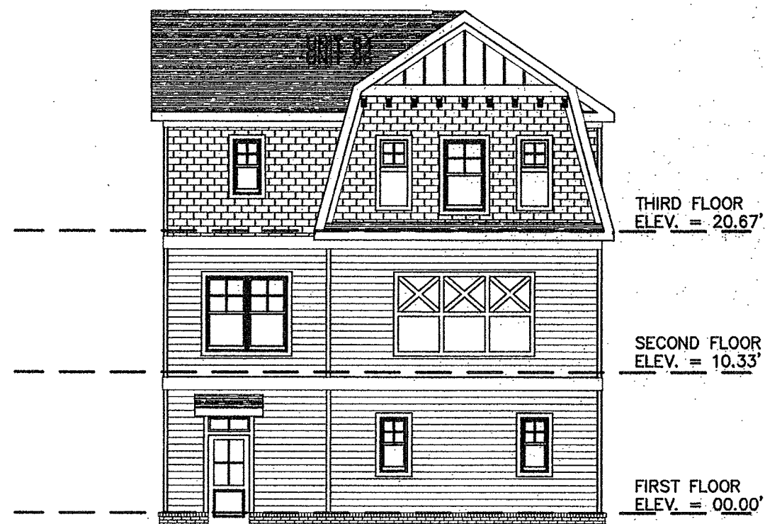
REAR ELEVATION (PUBLIC STREET SIDE)