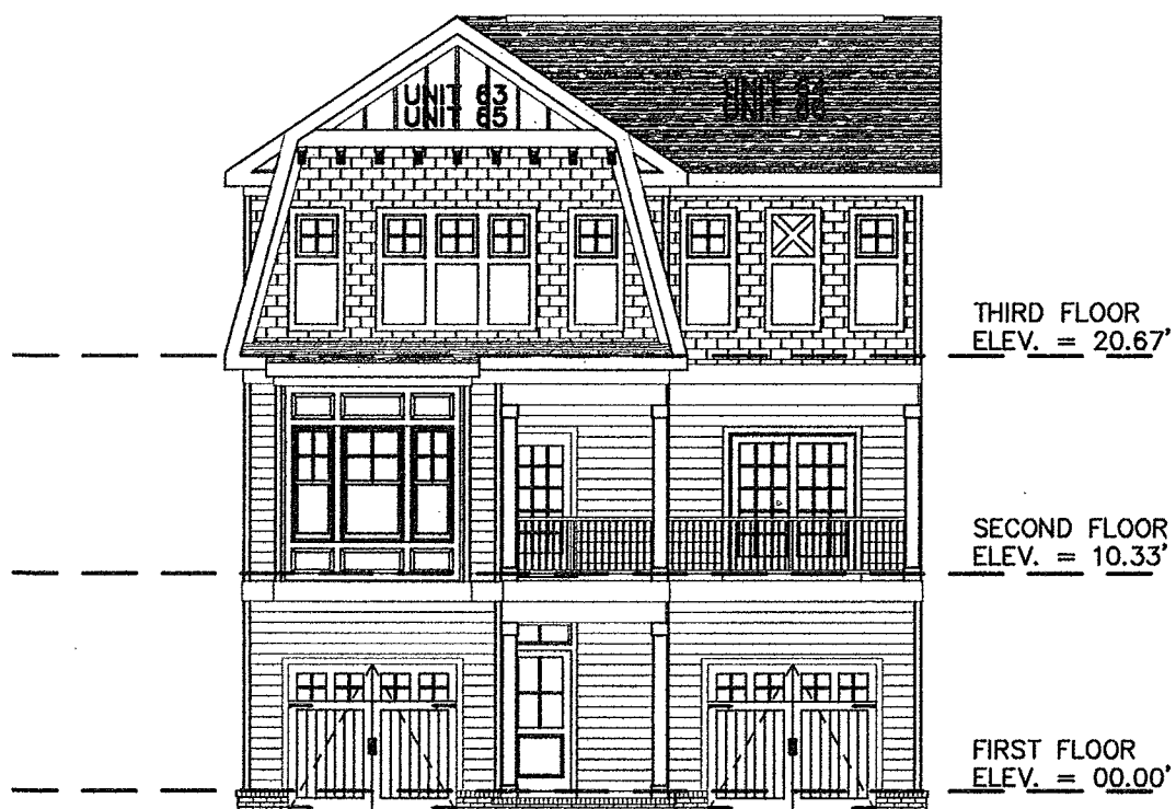
FRONT ELEVATION (PRIVATE LANE SIDE)