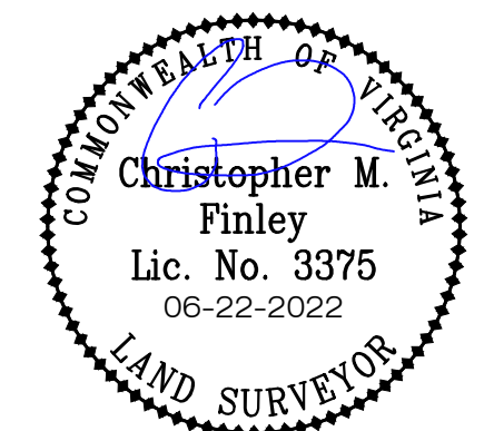
EXHIBIT "D" PLAT SHOWING UNITS 1-3, PHASE 1 GRANDE OAK LAND CONDOMINIUM

CHRISTOPHER M. FINLEY, L.S. LIC. No.: 3375 CFINLEY@BALZER.CC