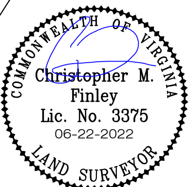
EXHIBIT "D" PLAT SHOWING UNITS 1-3, PHASE 1 GRANDE OAK LAND CONDOMINIUM