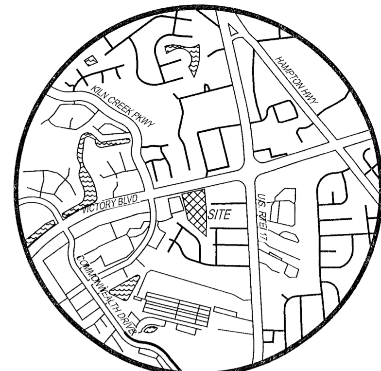
VICINITY MAP SCALE: 1"=2,000'