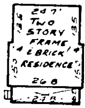
DETAIL SCALE 1" = 30'