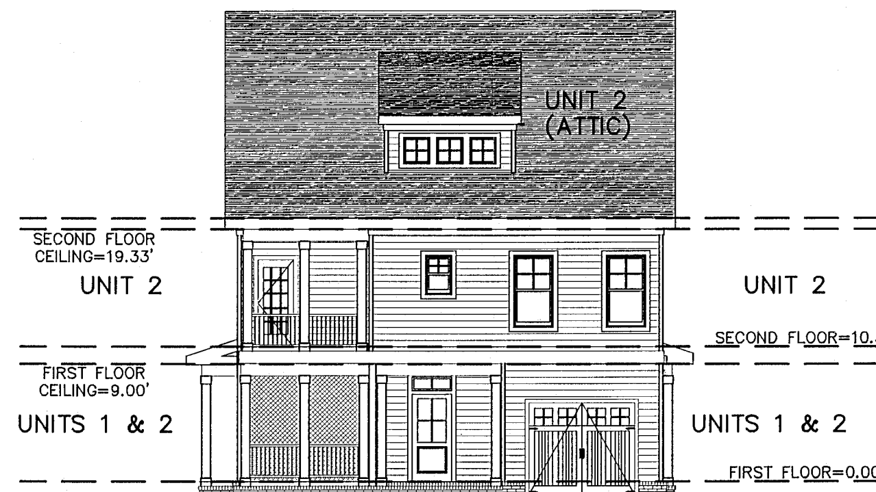
REAR ELEVATION (PRIVATE LANE SIDE)