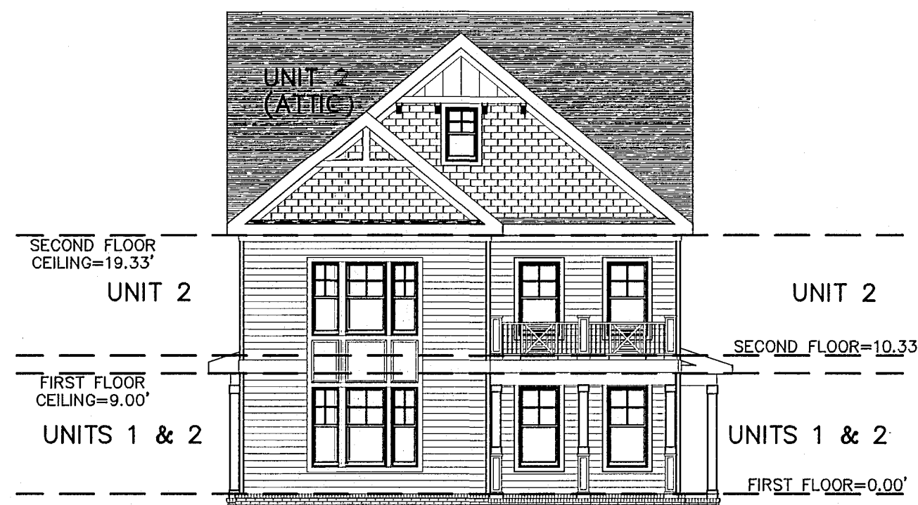
FRONT ELEVATION (PUBLIC STREET SIDE)