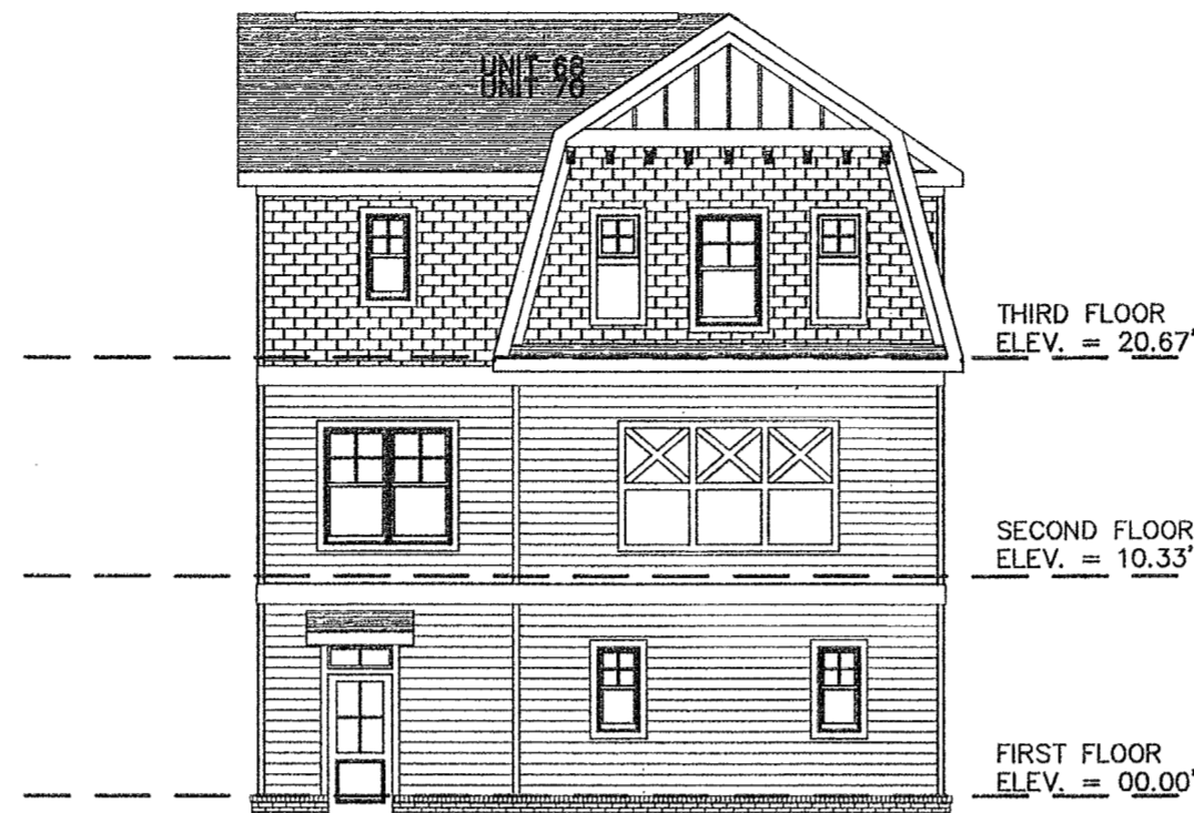
REAR ELEVATION (PUBLIC STREET SIDE)