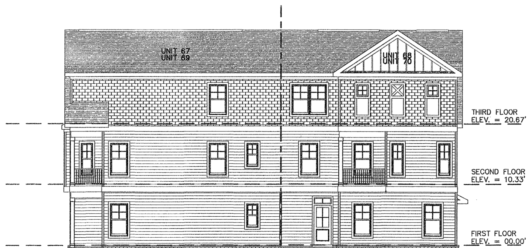
RIGHT SIDE ELEVATION