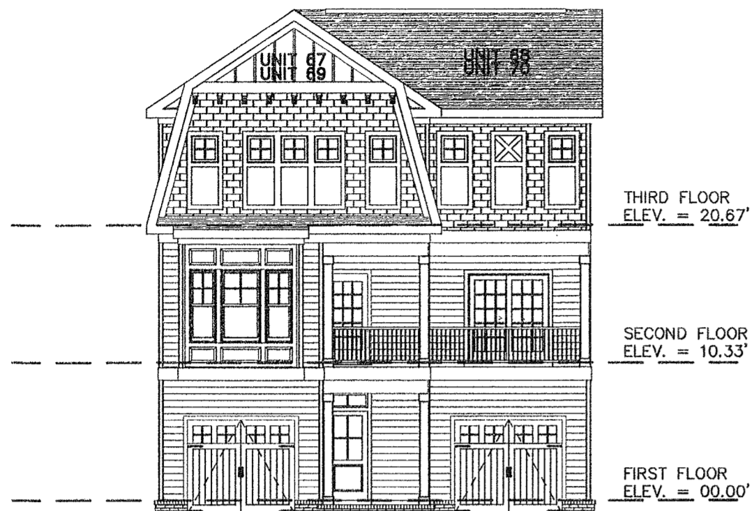
FRONT ELEVATION (PRIVATE LANE SIDE)